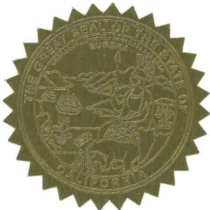
GAVIN NEWSOM Governor of California

IN WITNESS WHEREOF I have hereunto set my hand and caused the Great Seal of the State of California to be affixed this 14th day of November 2019.