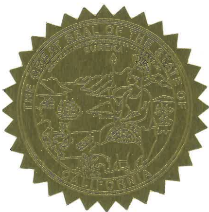
GAVIN NEWSOM Governor of California

IN WITNESS WHEREOF I have hereunto set my hand and caused the Great Seal of the State of California to be affixed this 14th day of November 2019.