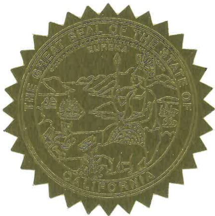
GAVIN NEWSOM Governor of California

IN WITNESS WHEREOF I have hereunto set my hand and caused the Great Seal of the State of California to be affixed this 14th day of November 2019.