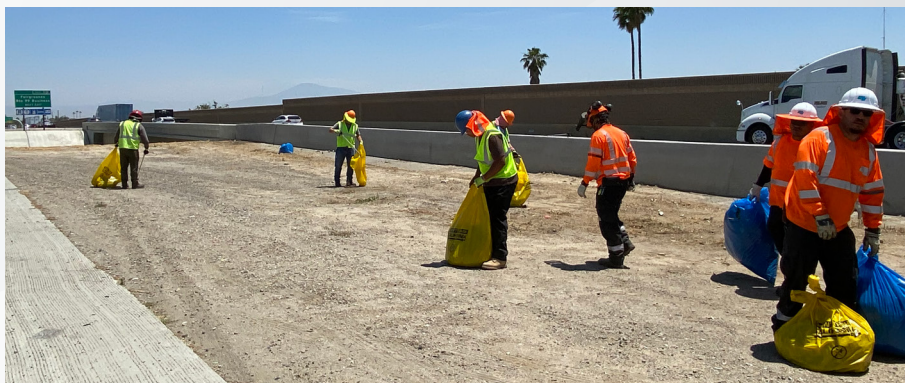
Bakersfield Maintenance and Clean California Crews