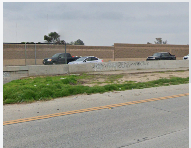
Southbound State Route 58 Martin Luther King Blvd.