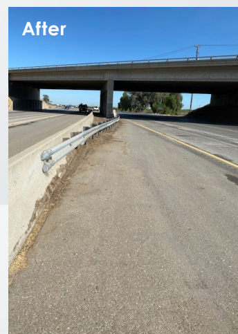
Southbound State Route 99 at Lerdo Highway