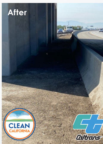
State Route 99 – Bakersfield