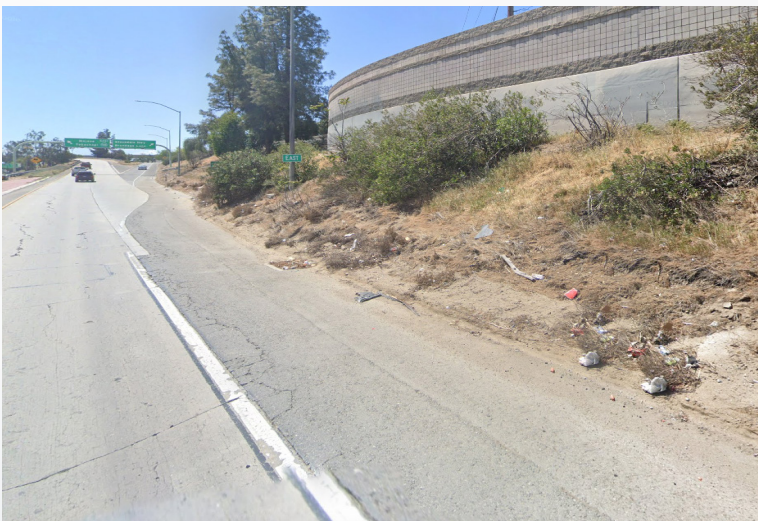
State Route 99 – Eastbound 58/Stockdale Highway Transition Ramp