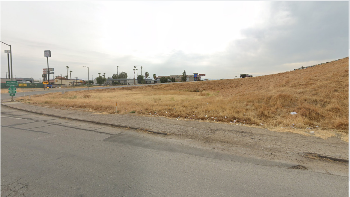
Weedpatch Hwy – Westbound 58 onramp