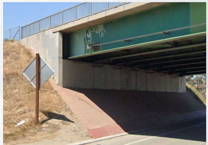
State Route 99 – Olive Drive