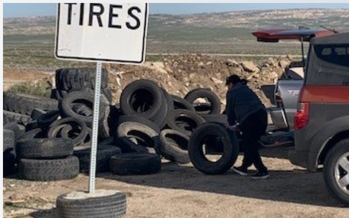
Kern County Tire Drop-off Events – Shafter, Taft and Bena Landfills