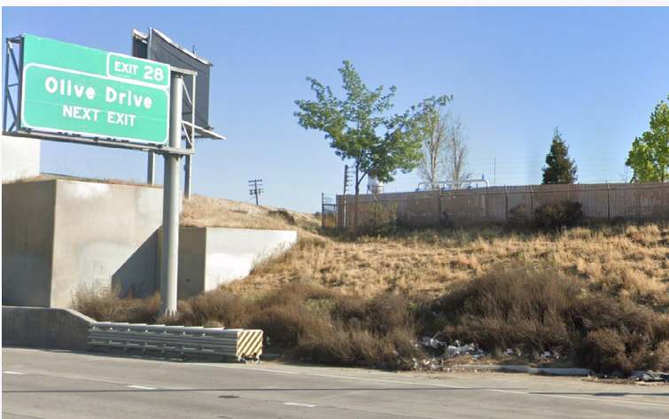
State Route 99 – Olive Drive