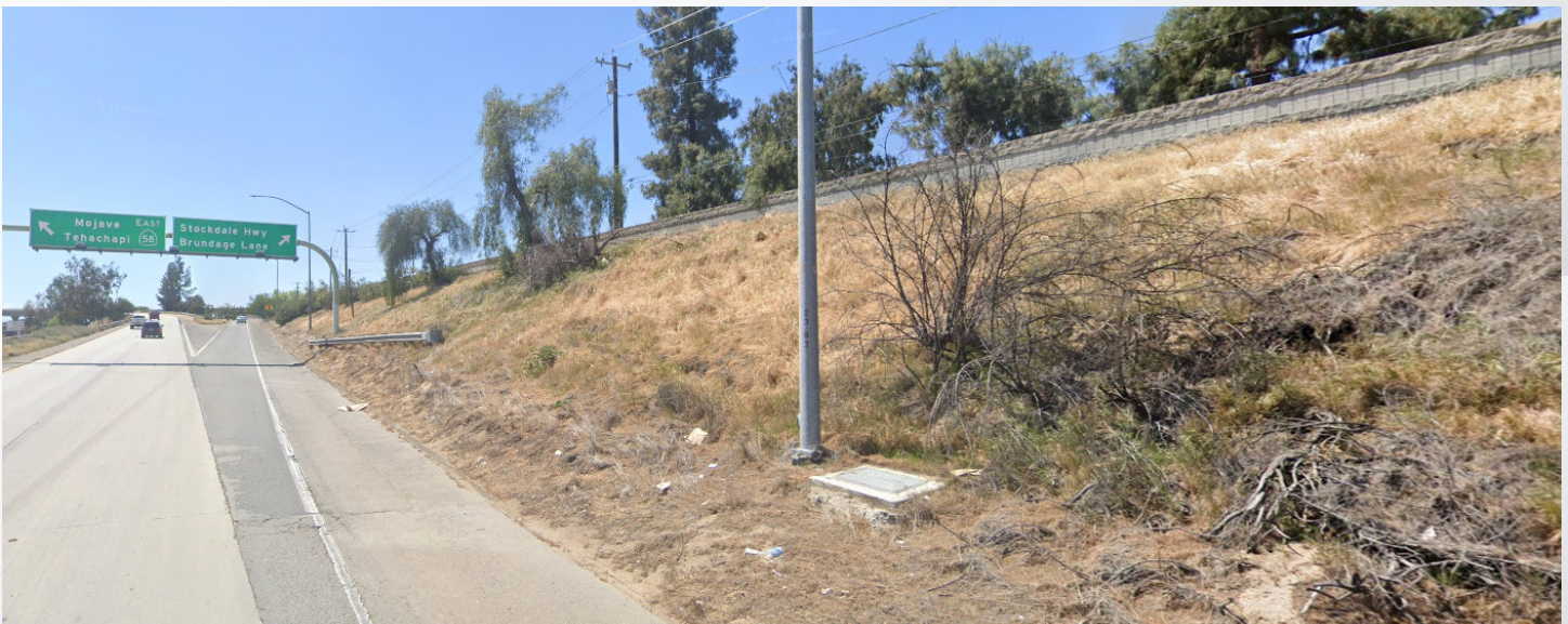
State Route 99 – Eastbound 58/Stockdale Highway Transition Ramp