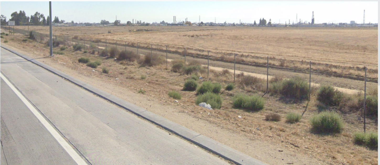
Southbound 99 – Hank Road